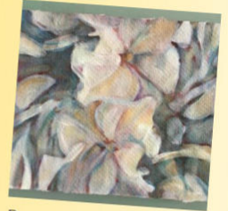
Brandstätter E. | lebt und liebt