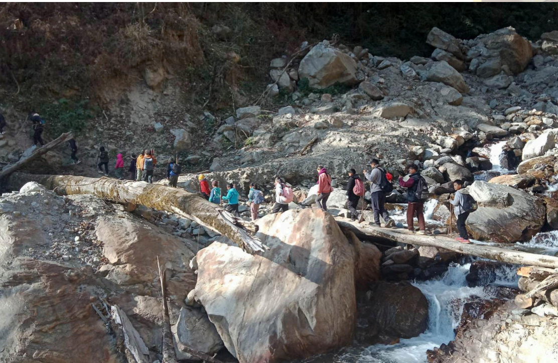
There were a number of obstacles to overcome on this hike - and a head for heights was necessary too...